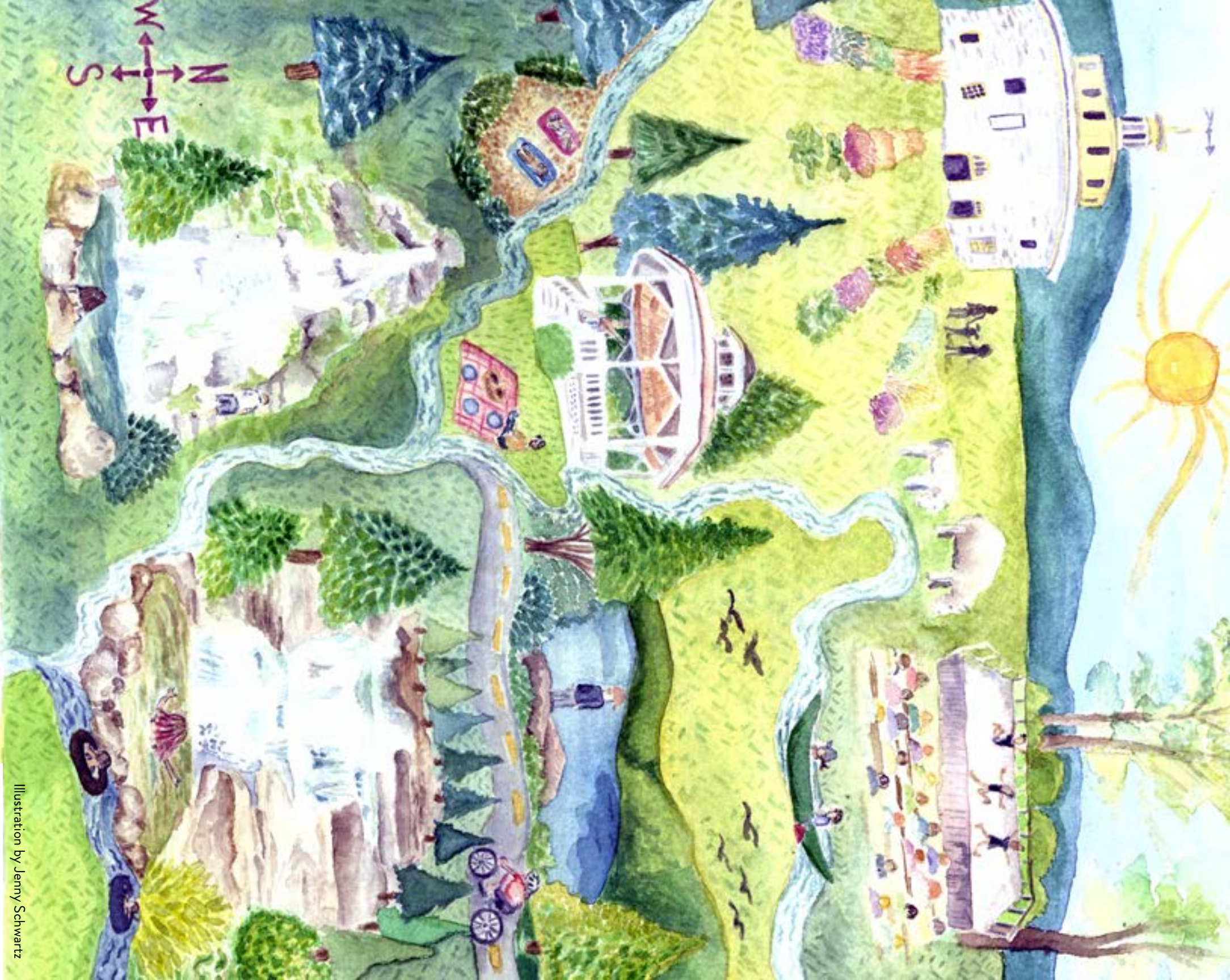
Illustration by Jenny Schwartz